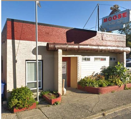
Snoqualmie Valley Moose Lodge – Google Street View 2022