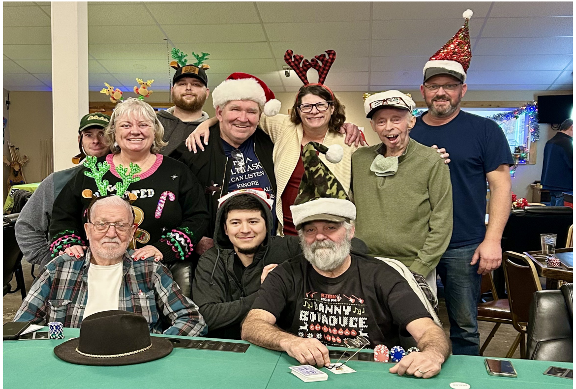
Texas Hold 'Em Group. Sundays at 2 in the SQ. Lots of laughs, and fellowship plus a little poker