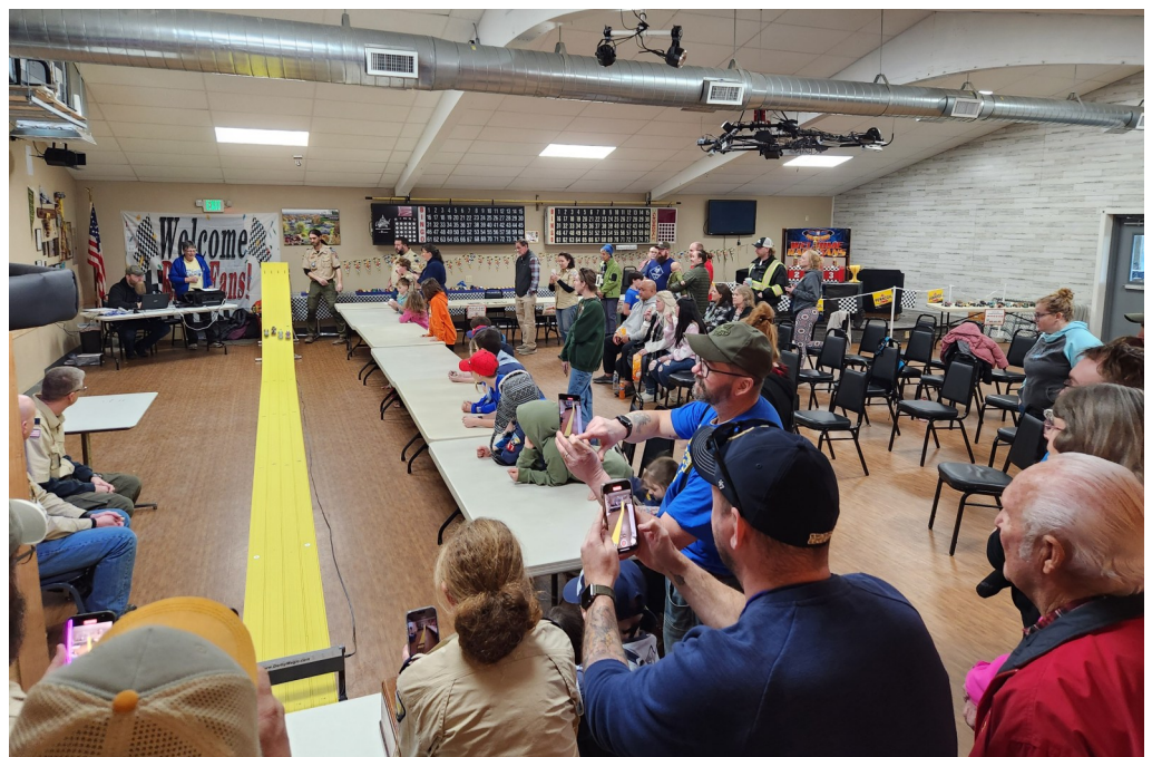
Over 30 years strong, Cub Scout Pack 267 annual Pinewood Derby. As always, THANK YOU Lodge 1905 for your continuing support for these future leaders.

Cub Scout Pack 267 would like to thank our sponsor, Lodge 1905, for their continued support—over 30 years and growing. These kids and their families are part of the future of the organizations like the Moose Lodge.