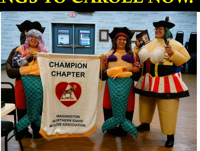
Congratulations to our First Place Chapter, Nisqually Valley #960!